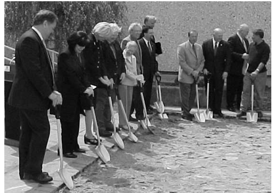
Ground-breaking for renovations to the Hunterdon County Library Headquarters April 27, 2004