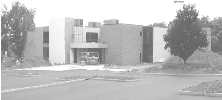
Prepared at: Hunterdon County Library, 2005 www.hunterdon.lib.nj.us