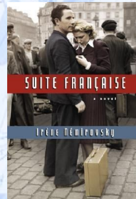
Suite Francaise by Irene Nimerovskiy Friday, February 24 at 10:00 am