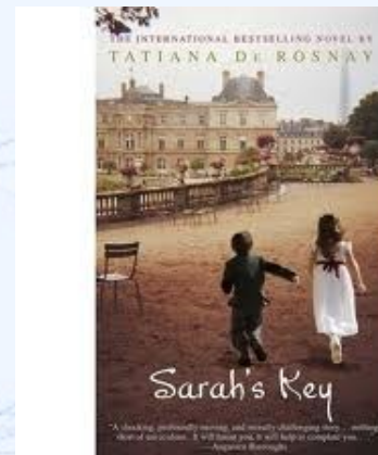
Sarah's Key by Tantianna de Rosnay Friday, April 27 at 10:00 am